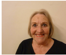
Narrator Assisting the audience with the smooth running of proceedings

Lilly is the Bishop's legal representative. Bishop Burton is very anxious to oversee this sensitive case... to ensure that justice is delivered fairly