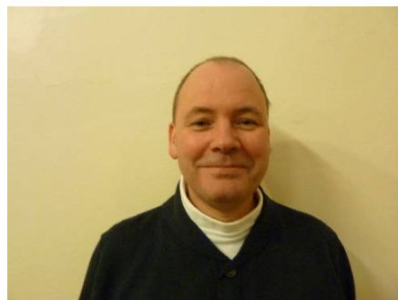
Reverend Tobias Byrne Curate of the Parish of St Ignatius the Unflappable

Gladys is Martin Peacock's housekeeper. She takes a pride in her work, especially her tea-making. She's worked at Steeply Willows for many years but recent events have caused her to question her employment!